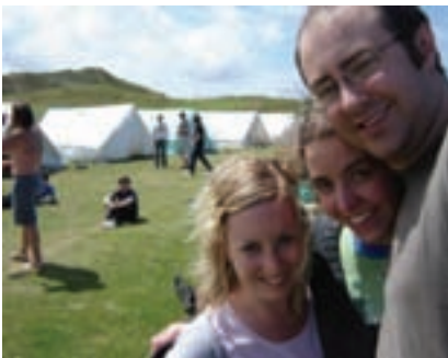
SU Carrickfinn boys' camp Then we visited the Junior Teens Week at Mullarton House in

We kicked off with a lively stay at Scripture Union's Carrickfinn boys' camp in Co. Donegal where we led workshops over 2 days speaking about God's take on relationships.